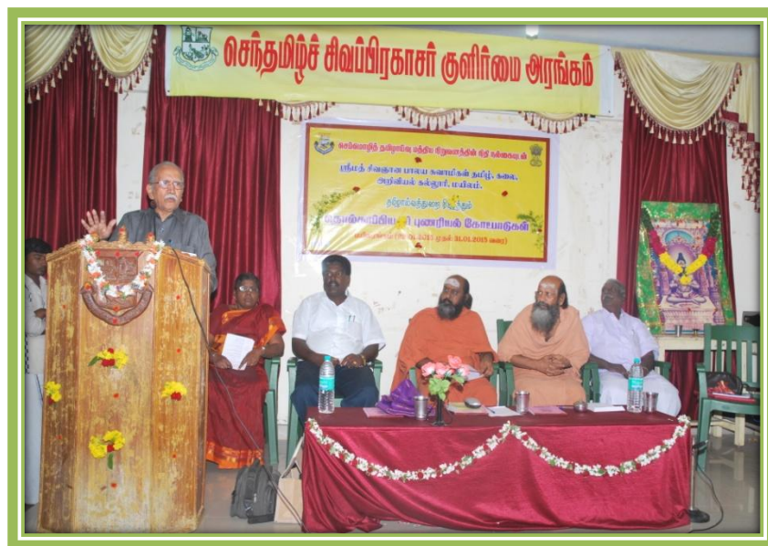
Department of Tamil conducted Special Seminar

The Alumni of the Institution are invited as the resource persons of the programmes organized in the institution.