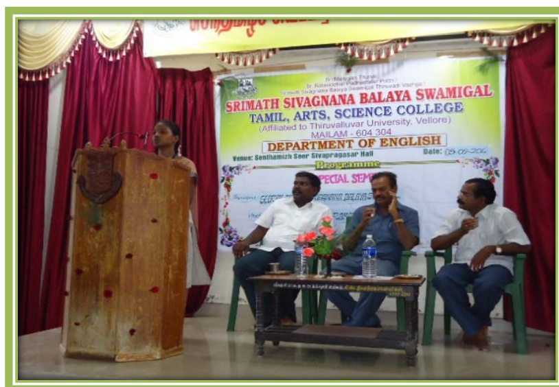
Department of English conducted Weekly Seminar on 22 nd sep 2015

The Students of the institution effectively communicate among peer groups.