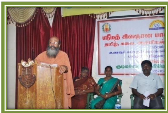
Inauguration day "Consumer Citizen Club" on 25-10-2015