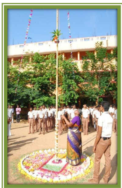
Independence Day celebration