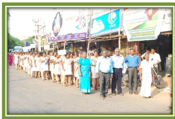
Youth Day Celebration rally