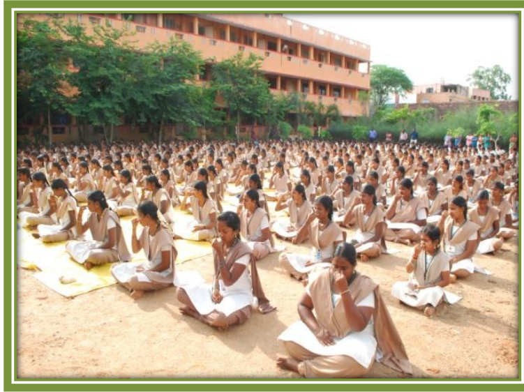
World Yoga Celebration