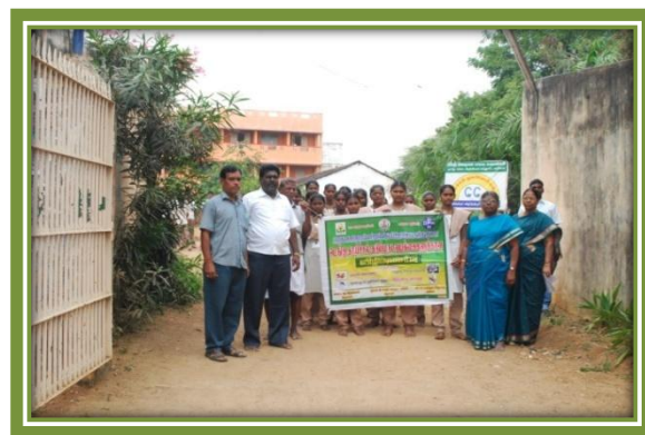
Dengue Awareness rally