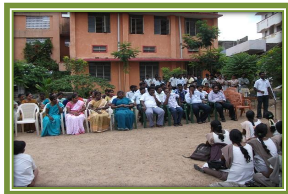
Teachers Day Celebration on Sep 5 th 2015